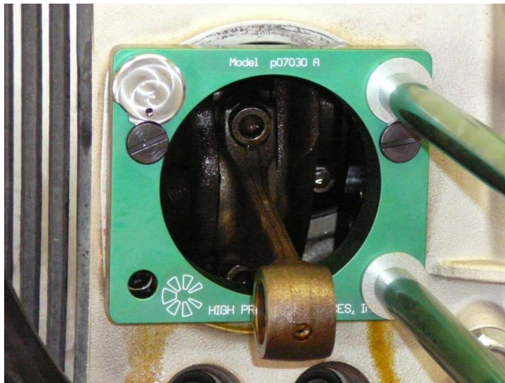
Figure 8: Mounting configuration for oil passage drilling.