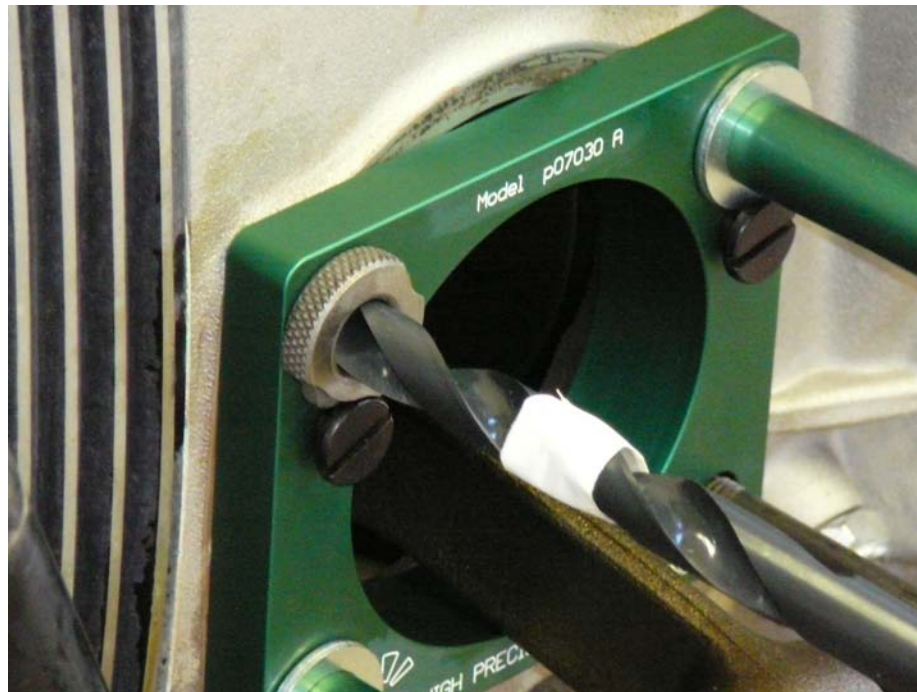
Figure 4: Drill pilot hole.