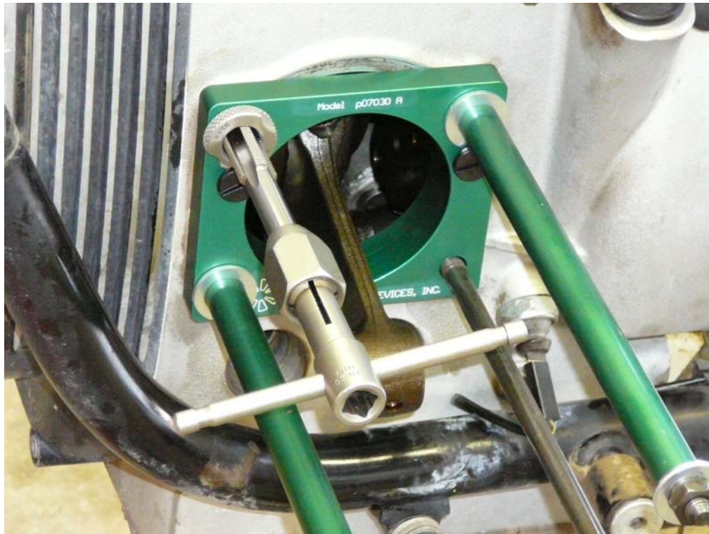
Figure 5: Tapping the hole.