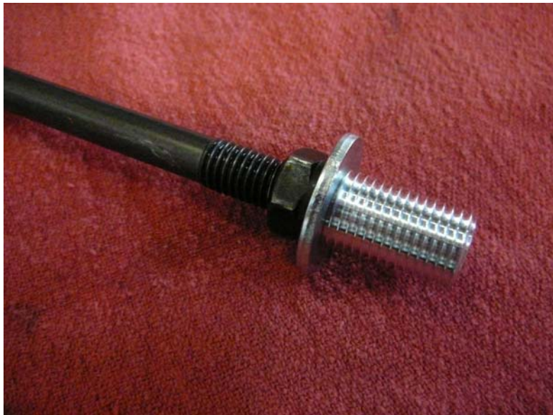
Figure 6: Installation setup for threaded insert.

Now, using the stud as a handle, thread the insert into the case until the washer comes flush with the face of the case. Snug it up gently, then leave it alone for about an hour, during which time the threadlocker will take an initial set. After an hour you may come back and break loose the head nut securing the insert, then carefully unscrew the stud from the insert. Using a small straightedge check that the end of the insert is truly flush with the face of the case. It is best to leave the assembly at this stage for at least another hour or two to ensure that the threadlocker has cured enough that subsequent steps don't upset the insert.