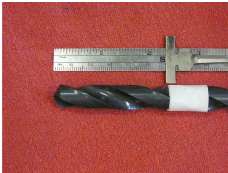
Figure 3: Place a tape marker on drill bit 58mm from tip.