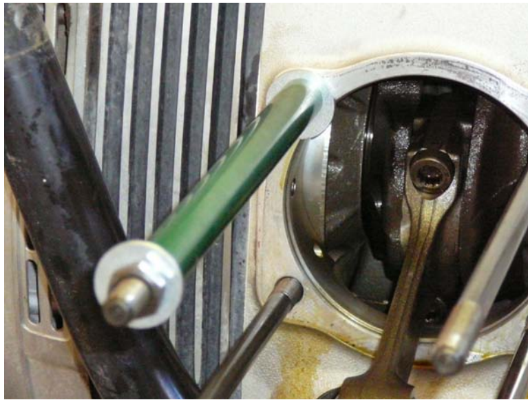
Figure 10: Installation of head stud.