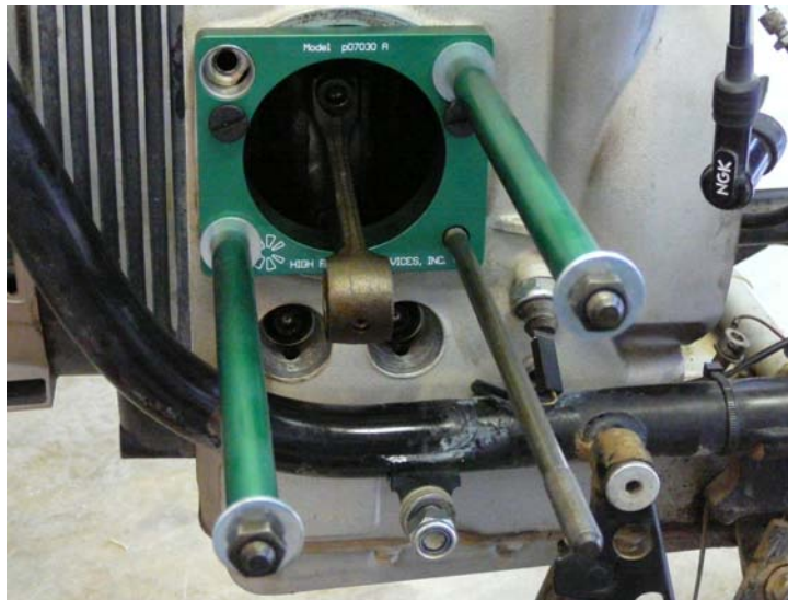
Figure 2: Proper HPD Stud Tool installation.