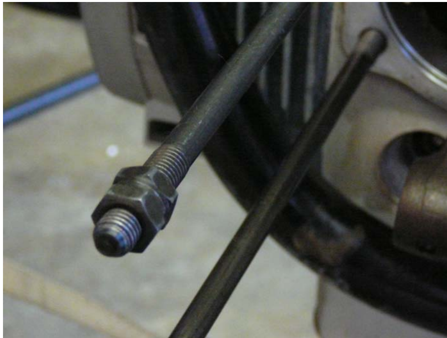
Figure 1: Removal of stripped stud.